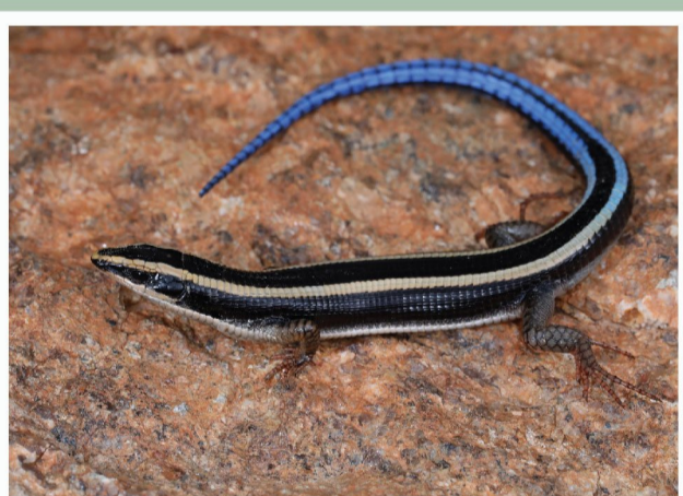
Dwarf Plated Lizard ( Cordylus subcaeruleus )