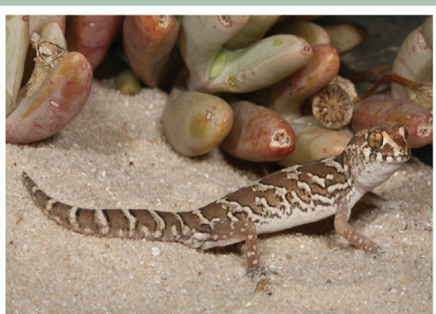
Large-scaled Banded Gecko ( Pachydactylus macrolepis )