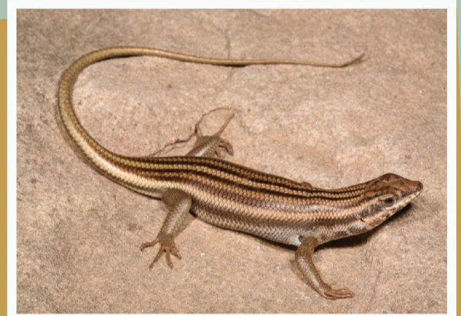
Western Rock Skink ( Trachylepis sulcata )