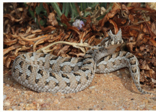
Many-horned Adder ( Bitis cornuta )