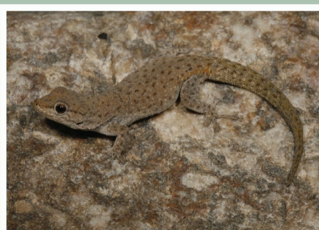
Namaqua Day Gecko ( Rhopropella ocellata )