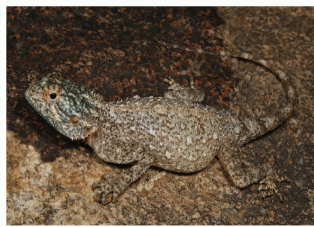
Southern Rock Agama ( Agama atra )