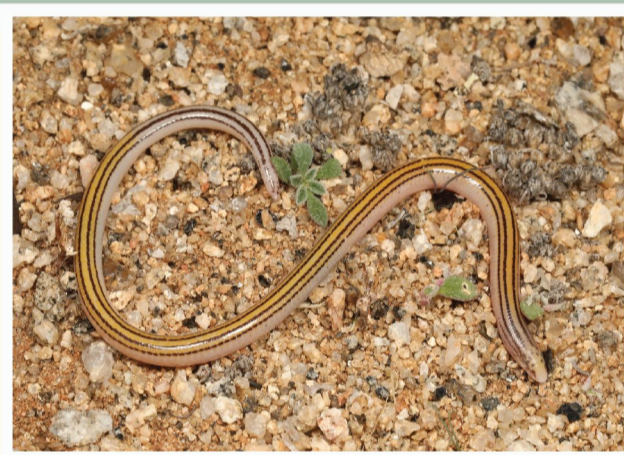
Namaqualand Dwarf Legless Skink ( Acontias tristis/lineatus )