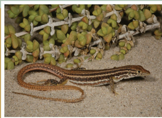
Namaqua Sand Lizard ( Pedioplanis namaquensis )