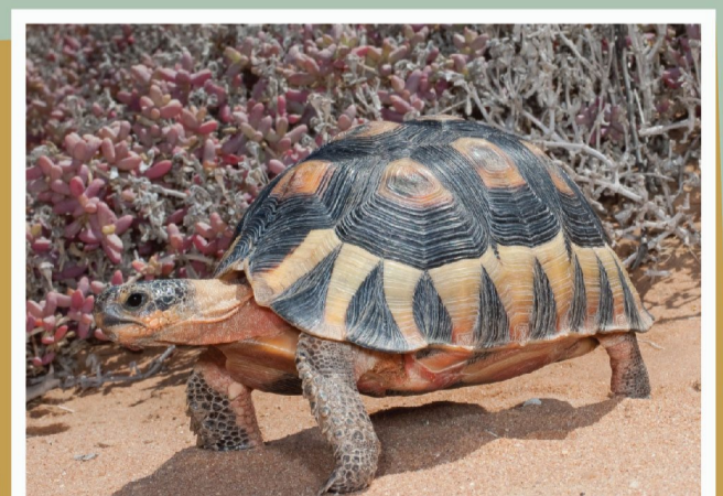
Angulate Tortoise ( Chersina angulata )

The Kokerboom Biological Research Station is an 850-hectare facility nestled among the pristine koppies of Namaqualand, just outside Springbok in the Northern Cape. Known for its rich biodiversity and unique, endemic flora, the area also features diverse fauna and notable geology. The station provides secure, affordable accommodation and fieldwork facilities for local and international students, supporting collaborative research across a wide range of disciplines.