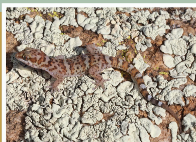
Weber's Gecko ( Pachydactylus weberi )