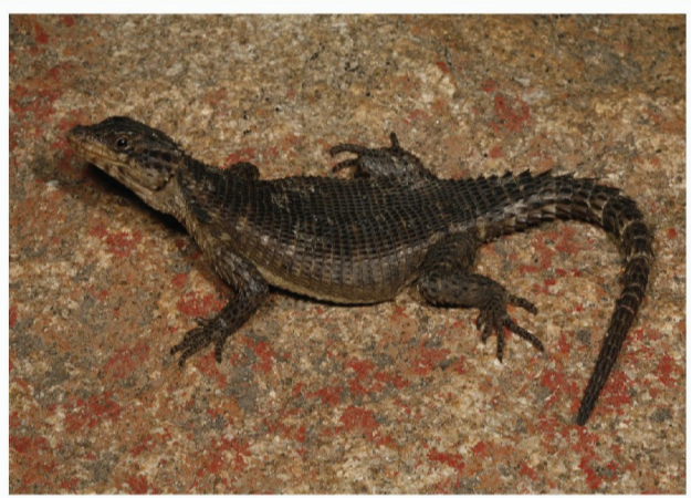
Karoo Girdled Lizard ( Karusasaurus polyzonus )