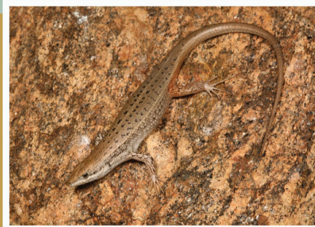
Variegated Skink ( Trachylepis variegata )