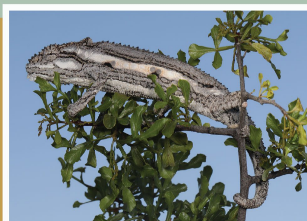
Western Dwarf Chameleon ( Bradypodion occidentale )