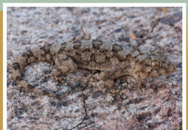
Namaqua Gecko ( Pachydactylus namaquensis )