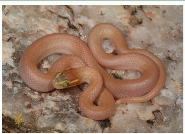
Bug-eyed House Snake ( Boaedon mentalis )