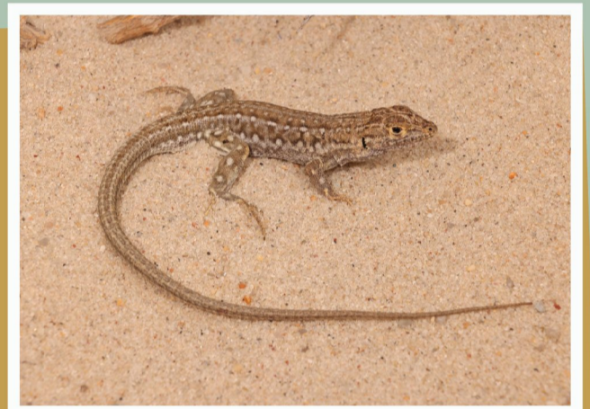
Knox's Desert Lizard ( Meroleos knoxii )